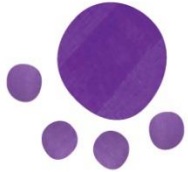
Regional Children's Directors

National director will be accountable to the Vulnerable Children's Board for establishing regional arrangements, including regional directors.